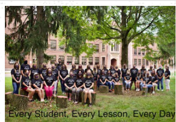
Every Student, Every Lesson, Every Day